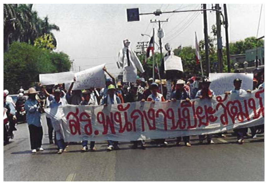
Workers protest the closure of the Piyavat plant without compensation.

union. Workers who were transferred from Piyavat manufacturing before its closure deny any involvement in the Piyavat workers union.