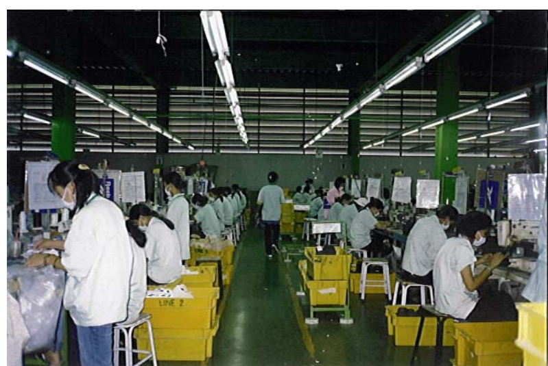
Siam Unisole employees in the stitching line. This photograph was taken after the introduction of personal protective equipment.

Although the facilities are in urban areas, most workers in Wongpaitoon group are from villages in the remote provinces, especially in the Northeast region of Thailand. Workers are generally poorly educated. In Siam Unisole, 57% of workers completed primary school. Only 35% have education to secondary school level. Education attainment among workers Wongpaitoon is also low;