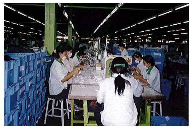
Workers stitching uppers in a Siam Unisole factory. Manufacturers provide cloth-masks to workers to satisfy the codes of conduct. However, as much of the air-born pollutants in the factories are chemical and solvent-based, these masks are of little use.

After long protest by labor activists, Nike and Reebok agreed that their producers would use water-based solvents to eliminate the carcinogenic chemical toluene. Nike and Reebok have heavily advertised this fact. However, not all of the dangerous chemicals can be eliminated. Some of the most dangerous chemicals for processing, binding, and cleaning rubber are agents which pose a serious threat to unprotected workers.