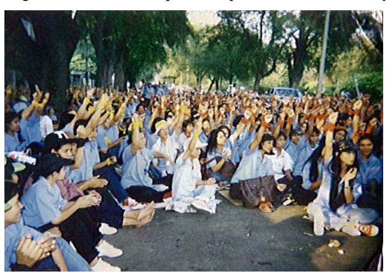
Piyavat workers demand compensation for over 700 laid-off workers in front of the Government House, Bangkok, March-April 1996.

The majority of the violations of the codes of conduct relate to excessive working hours, underpayment, denial of the freedom of association, suppression of trade union organizations, and inadequate occupational health and safety standards.